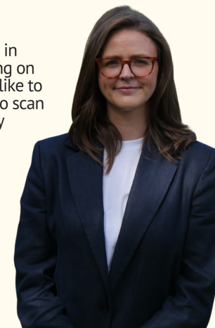
Lauren Edwards MP for Rochester and Strood