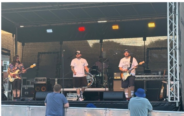
The Red Hot Chili Players gave a memorable performance to close Hallingbury 2025

Hallingbury 2025 was certainly a day to remember as Halling enjoyed another spectacular local event in the Recreation Ground and continued its tradition for outstanding summertime community events. In the Rec there was plenty of choice, and everyone could find something for them, whether this was the music, the food and drink available, or the numerous stalls. Halling's children were also entertained on the bouncy castles and fairground rides.