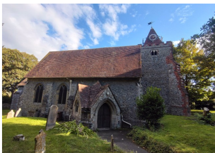
St. John's Church, Halling

Halling Sapphires Women's Institute will be meeting every third Wednesday during the autumn months at the Jubilee Hall, Upper Halling with meetings starting at 7.30pm. More information about the Sapphires can be found on their Facebook page (search Halling Sapphires WI). This year the WI will be creating a Poppy Appeal art work at the Jubilee Hall as well as the display for Remembrance outside St. John's Church.