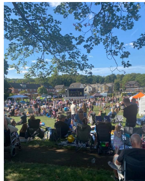
Hallingbury Saturday 9 August 2025